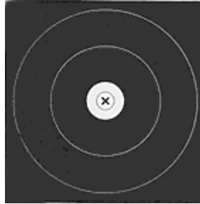
Figure 4. (Hunter Target)