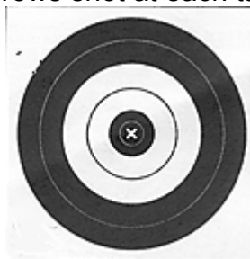
Figure 2. (Dakota Target)